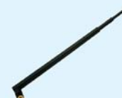
AirLive Indoor Antennas WAI-080