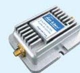
AirLive Indoor Boosters WPA-2400IG