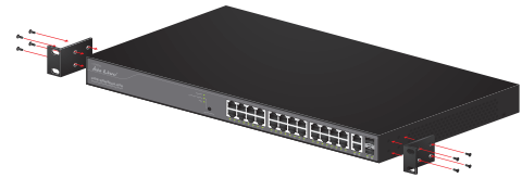
Fastening the brackets on the Switch