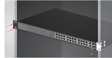
Attaching the Switch to a 19-inch rack