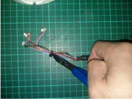
Cut the black band at wire segment

Cut the black band at wire segment. Remove the cable glands from the cable.