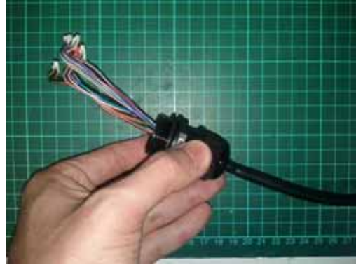
Remove the cable glands from the cable